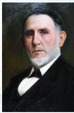
Washington Duke after treatment