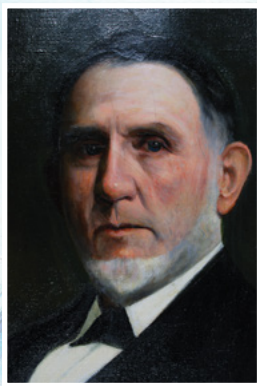
Washington Duke before inpainting