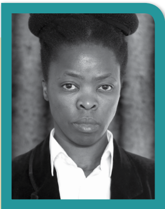
Photographer Zanele Muholi

No matter how or what you count, however, it is the case that Trump interrupted Clinton many more times than she did him. And during the second debate Anderson Cooper was moved to say to Trump, "Please allow her to respond. She didn't talk while you talked."